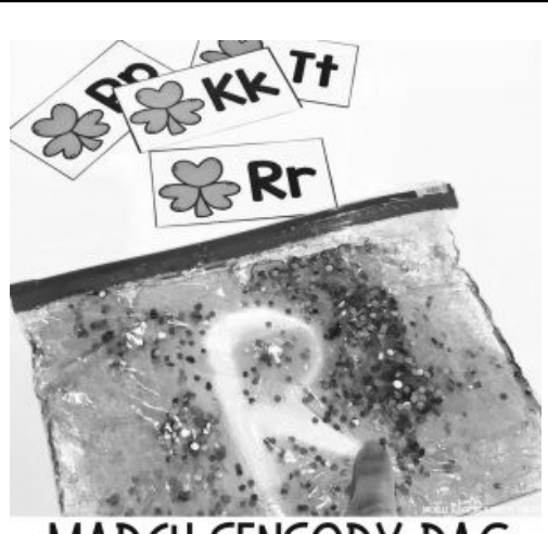
MARCH SENSORY BAG

To create this sensory bag, use clear hair gel, green food coloring, gold glitter, clear baggie, and clear packing tape. So easy!